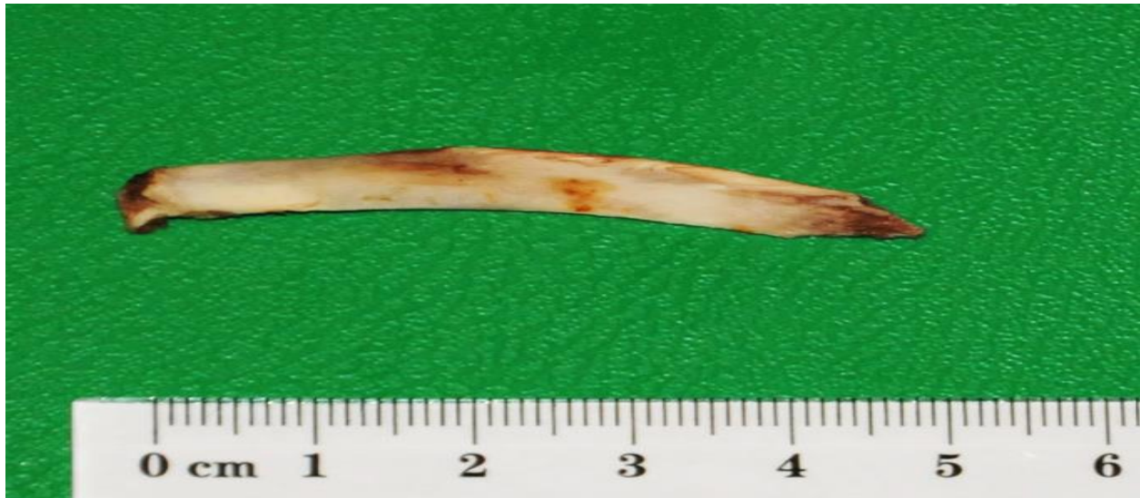
Image 2: Chicken bone, causing double perforation, extracted by laparoscopy

The patient underwent diagnostic laparoscopy. Sharp, foreign body that perforated the stomach wall at prepyloric area, penetrated the liver causing fissure with hemorrhagia and biliorrhagia, and forming local bilio peritonitis, was found ( Image 2 ). A 140 ml of bile was aspirated.