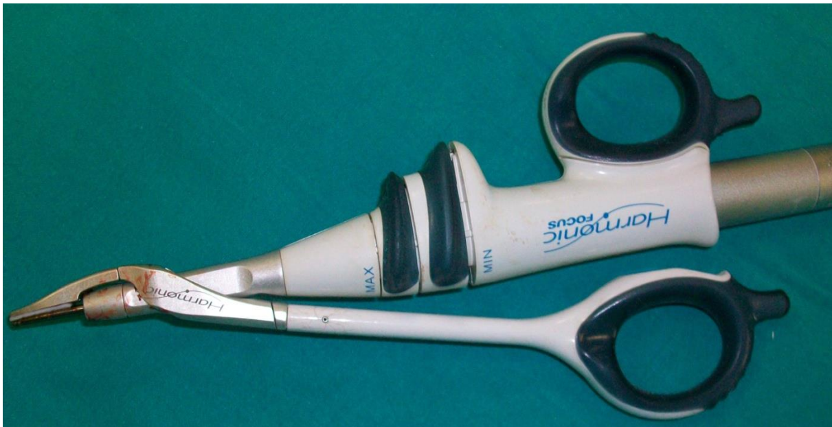
Figure 1. Harmonic scalpel focus shears